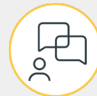
Lower Support Ratio