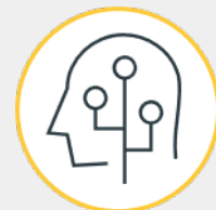
Interactive and Social Videos