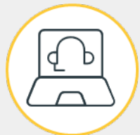
3D Business Environments